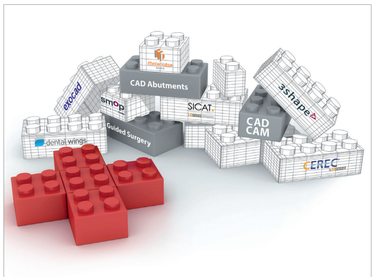
TRI Digital – interface to the digital world.