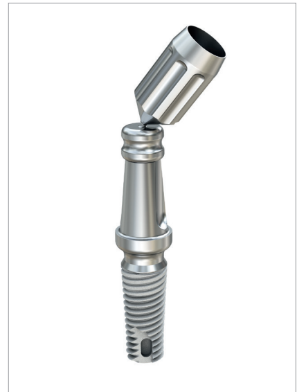
TRI 2in1 Impression Abutment.