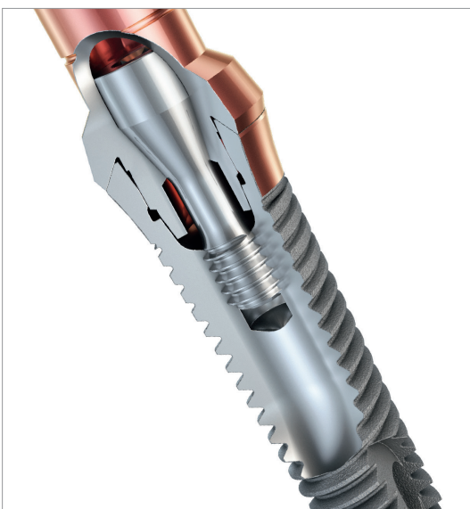
TRI Friction for a secure connection.