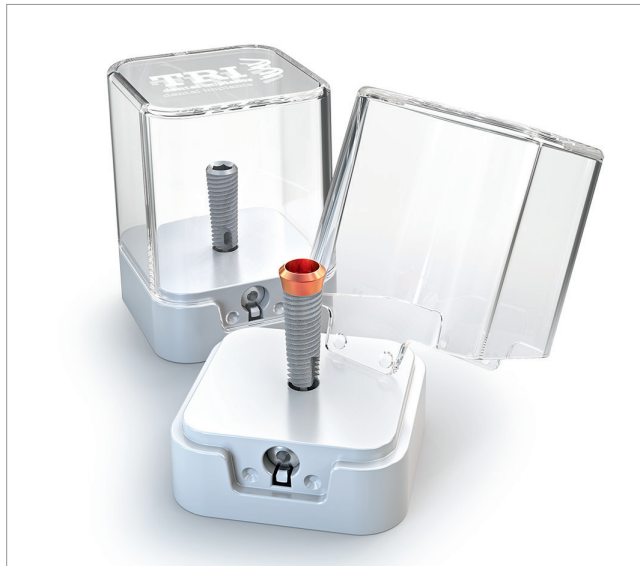
TRI Pod – ultimate simplicity.

The TRI Raptor Abutment range is the newest line of low profile direct implant overdenture attachments. With a low vertical profile of 2.1 mm and diameter of 4.4 mm, it is one of the smallest attachment systems on the market. This system offers multiple solutions for overdenture treatment planning in case of vertical space limitations.